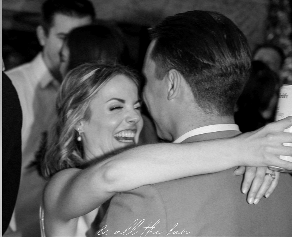
& all the fun